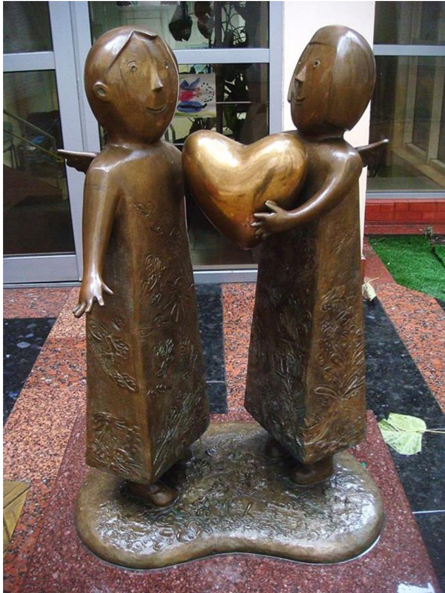
“Heart of the World”